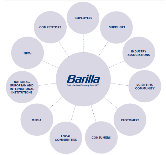
Fig. 3. Barilla's stakeholders map [16]

Among the policies practiced by Barilla, that of stakeholders' involvement in the development of initiatives, at different levels, from simple communication, and reaching collaboration in mutual projects, has a major importance.