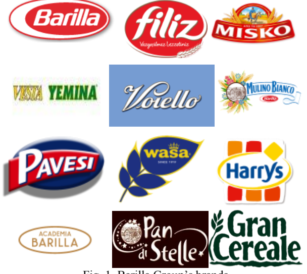
Fig. 1. Barilla Group's brands

The main priorities of Barilla focus on two lines of products: Italian pasta and bakery products that find their place in one of the following brands: